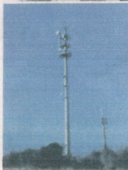
There are 4,500 mobile telecommunications masts in Ireland