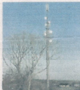
Mobile Phone Mast

But it might also be an implicit admission by the mobile phone companies that we just don't know enough yet to make the conclusions that we are making.